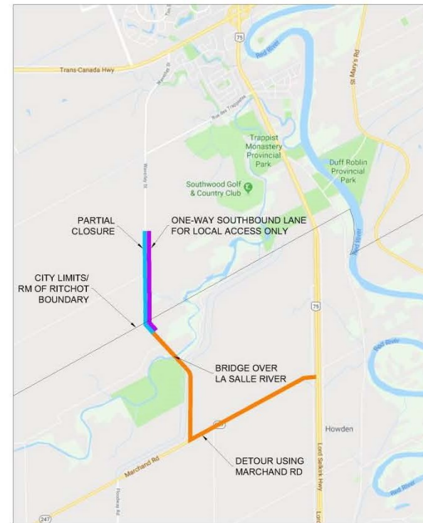
STAGE 3 (2020 CONSTRUCTION)