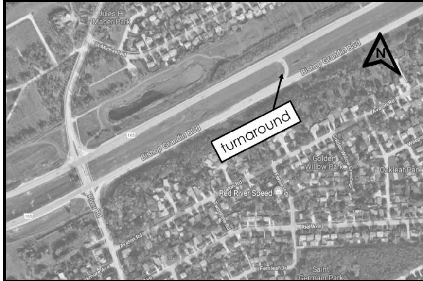
Figure 2 - Turnaround on Bishop Grandin Blvd. near River Rd.

This alternative would allow eastbound motorists to focus on one stream of traffic at a time instead of trying to find a gap in both directions of traffic. A suitable location for such a turnaround could be investigated at a point approximately 250 metres south of 2427 Waverley Street as shown in Figure 3.