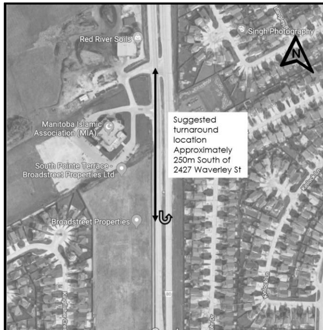
Figure 3 - Proposed turnaround location on Waverley Street

This alternative would allow eastbound motorists to focus on one stream of traffic at a time instead of trying to find a gap in both directions of traffic. A suitable location for such a turnaround could be investigated at a point approximately 250 metres south of 2427 Waverley Street as shown in Figure 3.